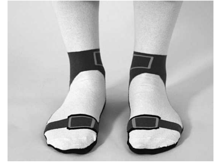
Socks-with-sandals without sandals: This week's second prize.

The Style Conversational: The Empress's weekly online column discusses the week's new contest and results. Check it out at wapo.st/styleconv.